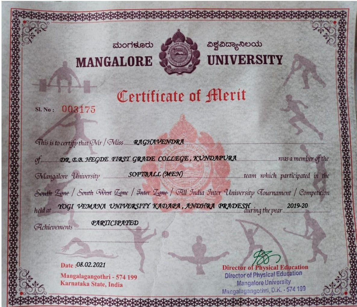
Sport – Softball