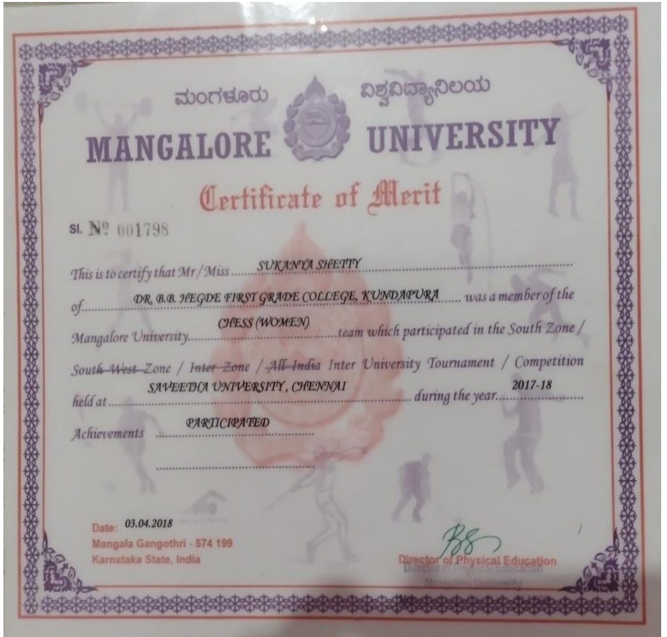
Sport - Chess