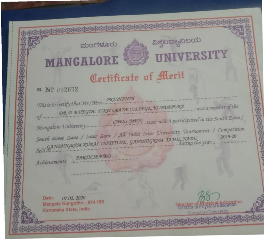
Sport - Chess