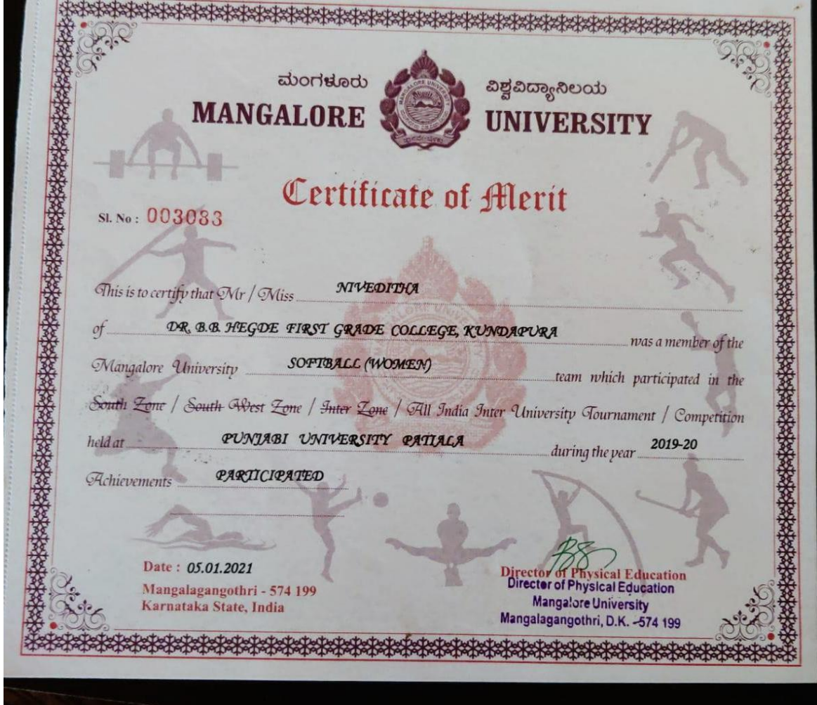
Sport - Softball