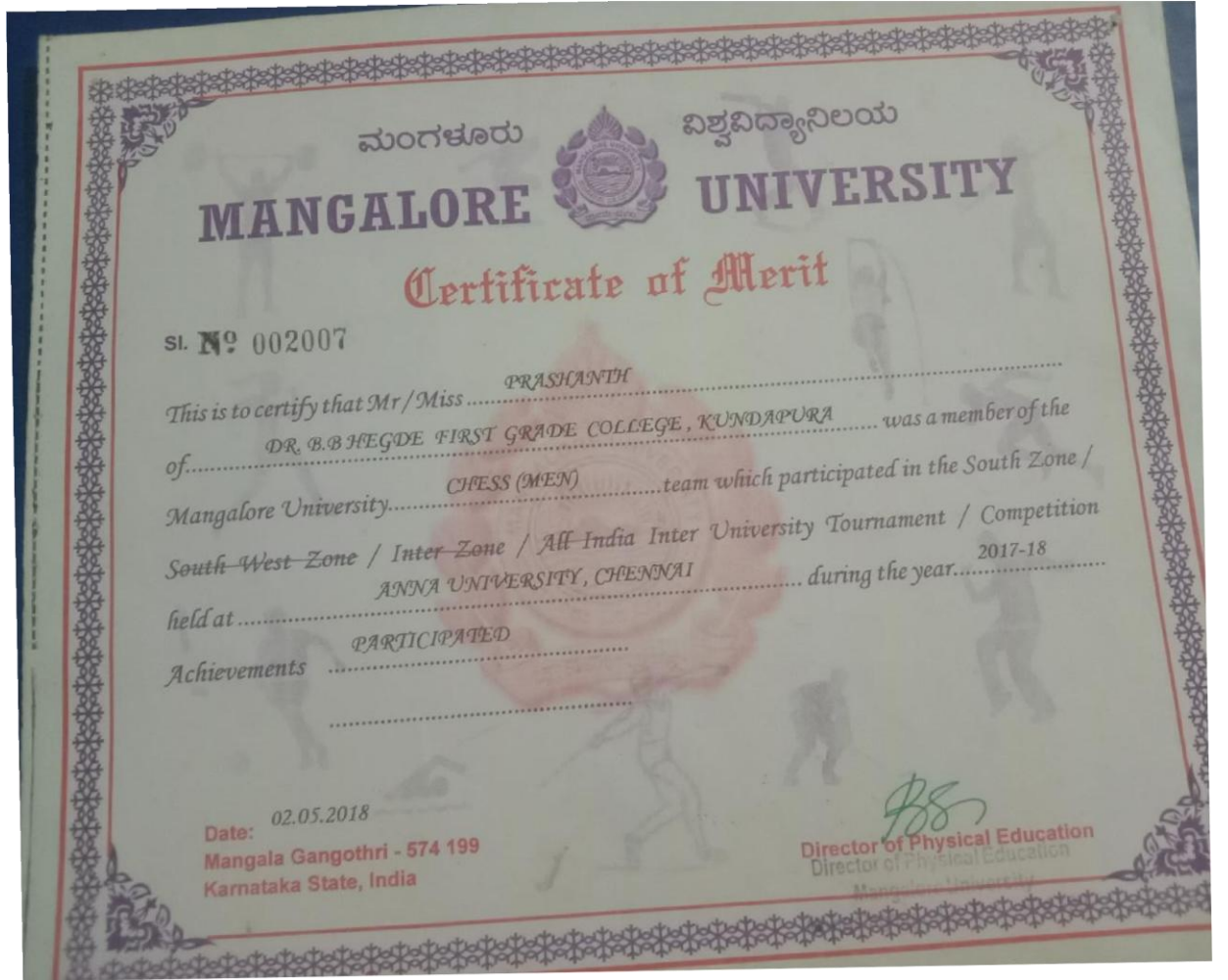
Sport - Chess