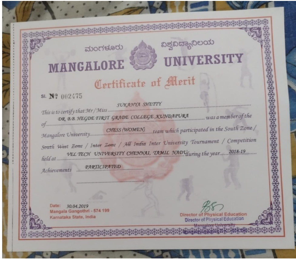
Sport - Chess