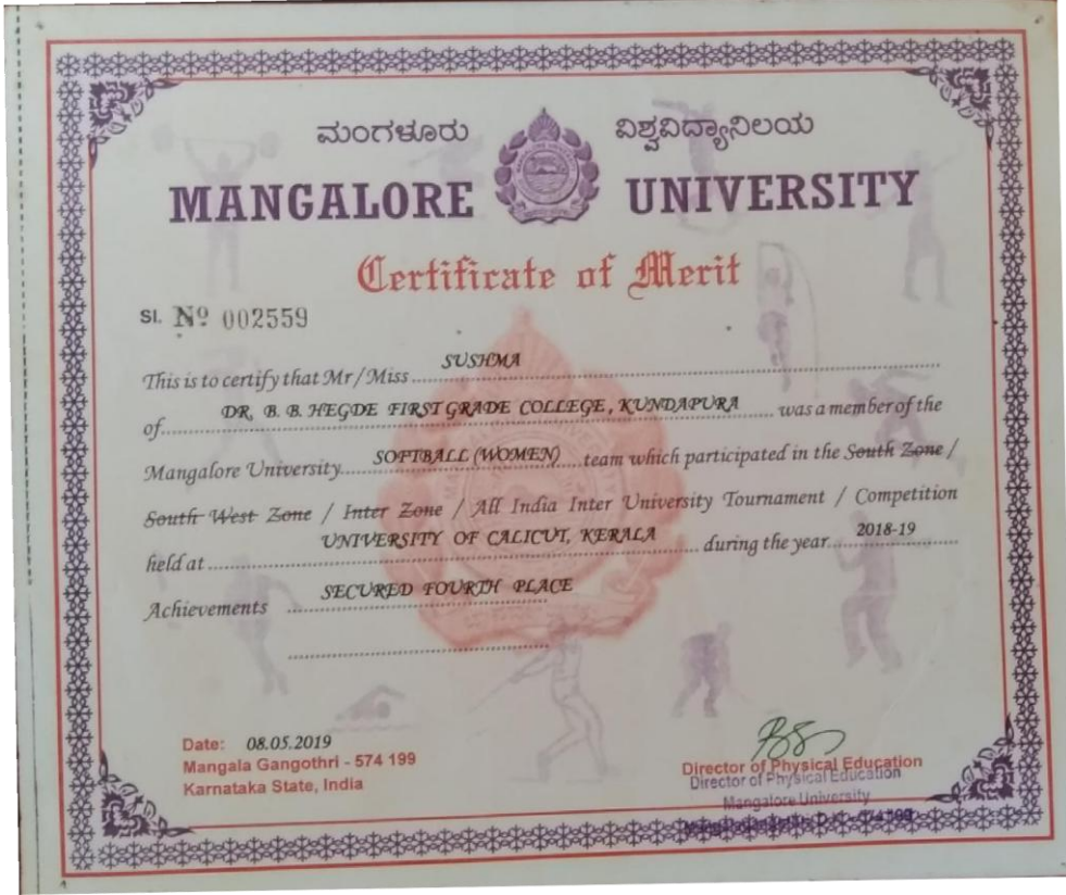
Sport - Softball